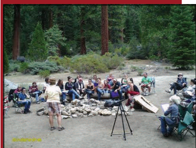
Leadership Institute at High Sierra

To get to the new Blog site go to the Columbia College home page, About Us, AWE and it's labeled Teachin' and Learnin' Blog .