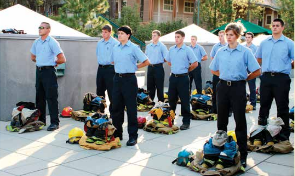
Fire Academy students prepare for a one-minute drill with turnout gear as part of their intensive four-month training program.

DEBATE CAMP, automotive test fees, volleyball equipment, cameras for telescopes and a choir trip were among the projects funded by the Columbia College Foundation's campus mini grant program in the 2014 school year.