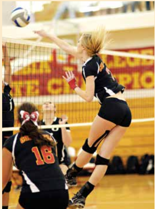
Claim Jumper volleyball athletes hit the road for competitions throughout the Central Valley Conference.