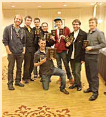
Debaters sharpen their skills and bring home honors from state competitions.