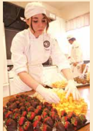
Culinary students add flavor to the popular Columbia Wine Tasting, a benefit for the Hospitality Management program.