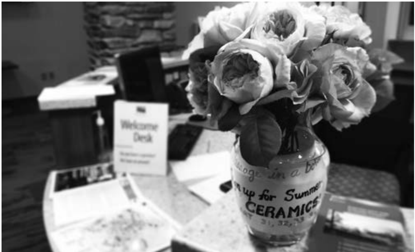
A faculty member adds her personal and clever touch to campus life by encouraging students to try their hands at ceramics. Columbia College faculty are incredibly vested in the success of the students in their programs and at the college overall.

If you receive financial aid, please contact the Financial Aid Office first before withdrawing from any course.